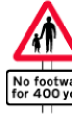
Pedestrians in road ahead

Gradients may be shown as a ratio i.e. 20% = 1:5