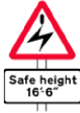
Overhead electric cable; plate indicates maximum height of vehicles which can pass safely