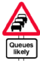
Traffic queues likely ahead