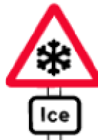
Risk of ice