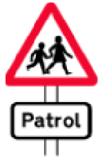
School crossing patrol ahead (some signs have amber lights which flash when children are crossing)