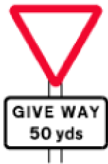
Distance to 'Give Way' line ahead

The priority through route is indicated by the broader line.