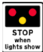
Light signals ahead at level crossing, airfield or bridge