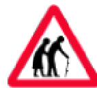
Frail (or blind or disabled) pedestrians likely to cross road ahead