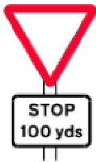
Distance to 'STOP' line ahead