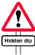
Other danger; plate indicates nature of danger