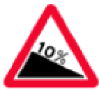
Steep hill downwards