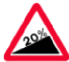
Steep hill upwards