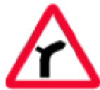
Junction on bend ahead