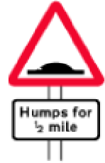
Distance over which road humps extend