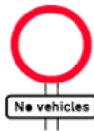
No vehicles except bicycles being pushed