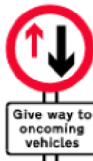
Give priority to vehicles from opposite direction