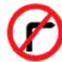
No right turn