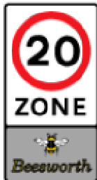
Entry to 20 mph zone

Signs with red circles are mostly prohibitive. Plates below signs qualify their message.