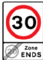
End of 20 mph zone